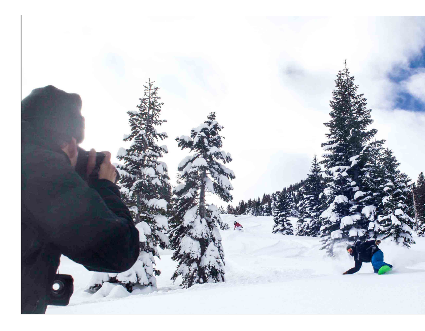
Book Your Guided Tour at AlpineSportsOutfitters.com